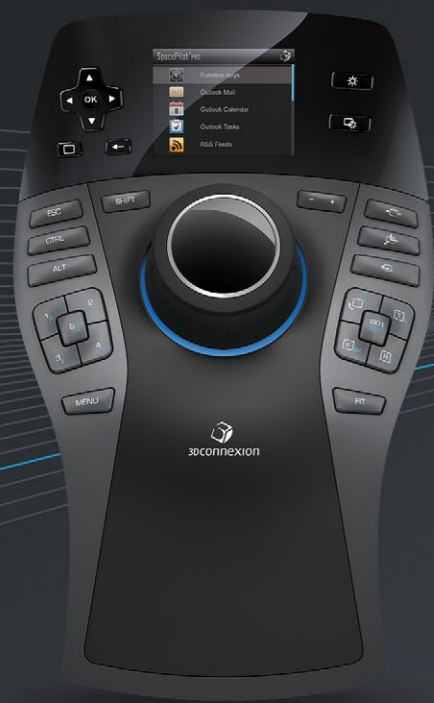
SpacePilot™ PRO The Ultimate Professional 3D Mouse