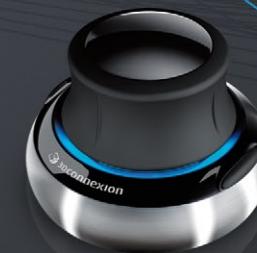
SpaceNavigator™ 3D Mouse

SpacePilot PRO is the ultimate professional 3D mouse, engineered to excel in today's most demanding 3D software environments.